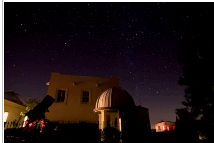
Outside viewing during the 2013 Music of the Spheres event. Lick Observatory volunteers share their telescopes with the public after the concert.

Eight weekends of Friday night viewing programs and Saturday Night Music of the Spheres concerts pleased the public who attended and kept our staff and volunteers very busy during the summer. Visitors attended wonderful concerts by artists in genres ranging from Jazz to Classical to Celtic music and lectures by prominent astronomers, such as Drs. Sandra Faber and Alex Filippenko. Visitors also viewed through the Lick Refractor and Nickel 1-meter telescopes and through smaller