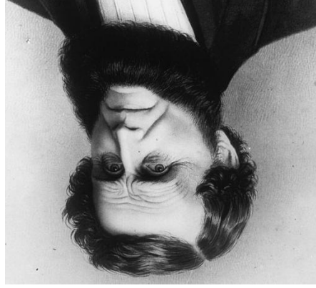
James Lick (1796-1876)

Lick Observatory was the world's first permanently equipped mountaintop astronomical observatory. It demonstrated the feasibility of sustained work at a high, remote site, where the best observing conditions are found. Almost all subsequent research observatories have followed suit. Lick's pioneering influence and inspirational contributions to science are acknowledged by astronomers worldwide.