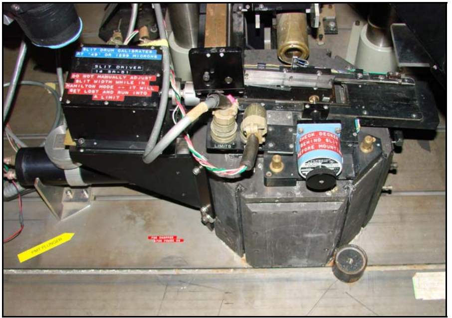
The chopper is inside of the Coude' slit pedestal.