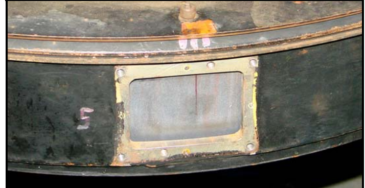
Ready to mount the pivot post.