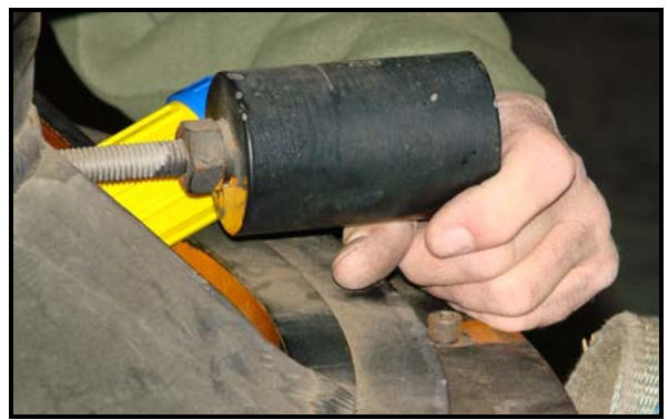
Support the weights with your hand while loosening the suspension bolts