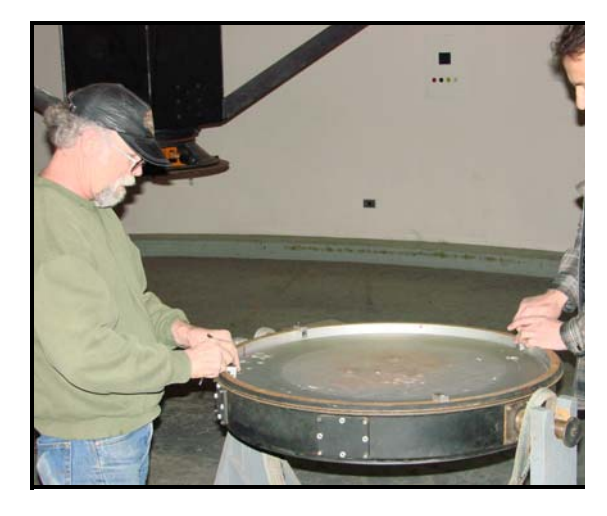
Remove the bolts holding the cell to the secondary frame and move the secondary frame out of the way.