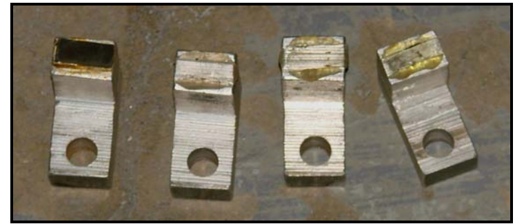
Four safety clips must be installed to hold the mirror when to enable flipping the mirror over. There should be foam on each clip surface that touches the glass for padding.