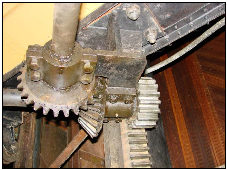
These are the leveling gears that ride on the racks.