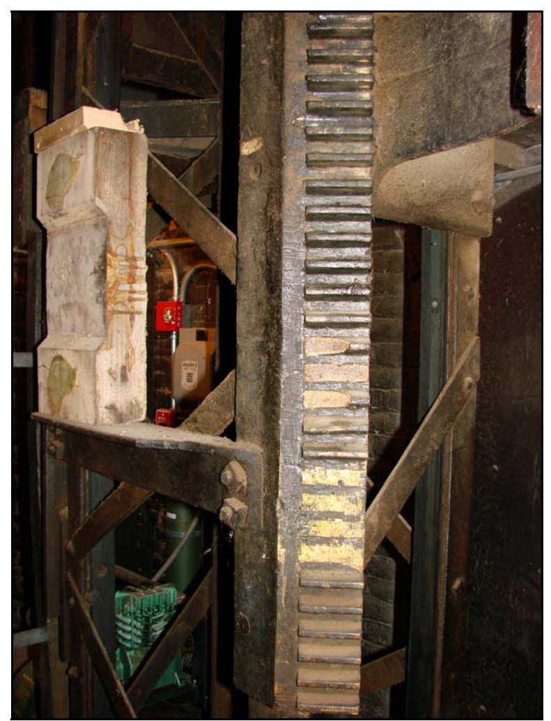
Here on this rack some upper teeth have broken out above the floor leveling section.