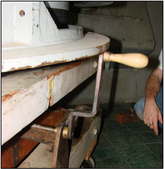
Make sure the mirror fixture is positioned so the crank clears the cell while lowering. We had to remount the cell and reposition the fixture.