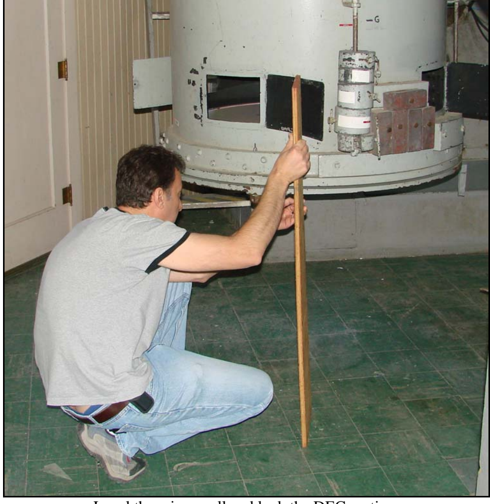
Level the mirror cell and lock the DEC motion.