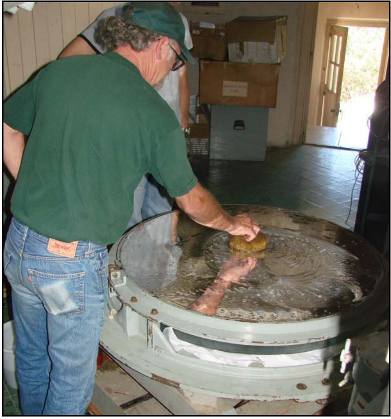
We washed the mirror in the cell using as little water as we could. The band for removing the mirror from the cell is missing so washing in the cell is necessary. Just be prepared for the water cleanup under and around the cell.