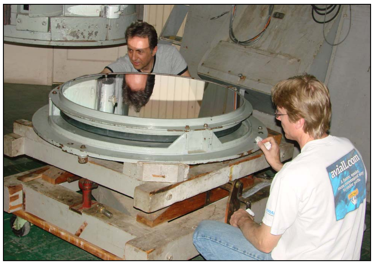
The finishing touches are done and the mirror is ready to remount in the telescope. Looks like a freshly coated optic.