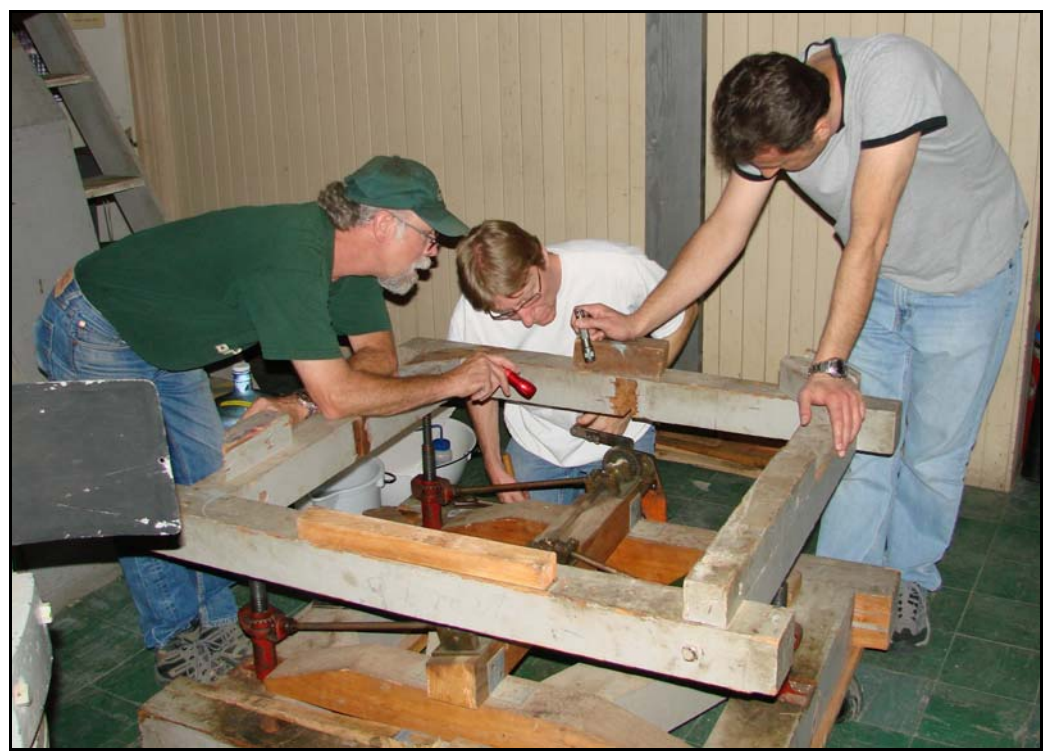
We had a broken tapered pin in the crank assembly of the mirror removal fixture. It pays to test before it is positioned under the mirror.

The telescope has not been used for a couple of years and even though covered has gotten quite dirty. This is an image of the dirty pre-washed mirror taken at a low angle through an access port. The mirror is SiO overcoated.