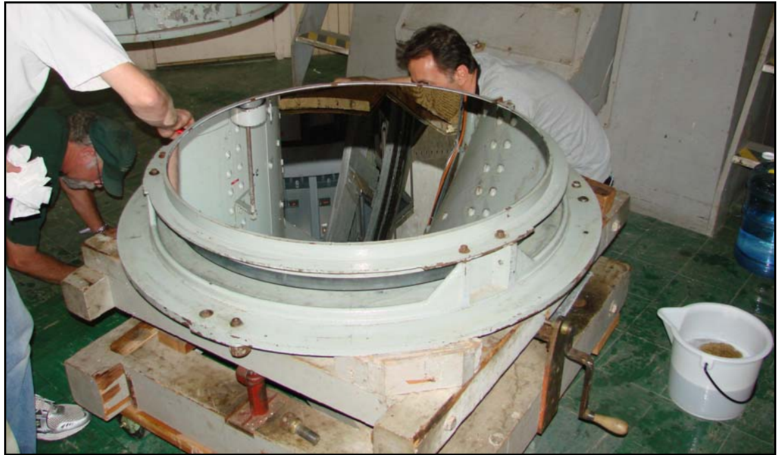
Drying the cell and floor after drying the mirror with blotter paper.