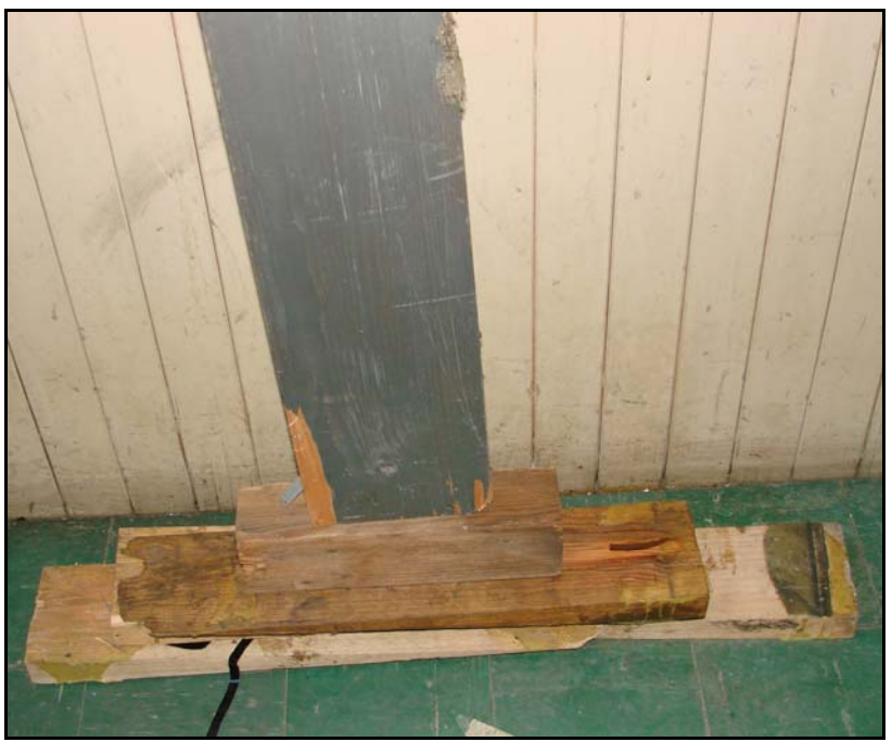
The wedge blocks used to level the telescope in RA.