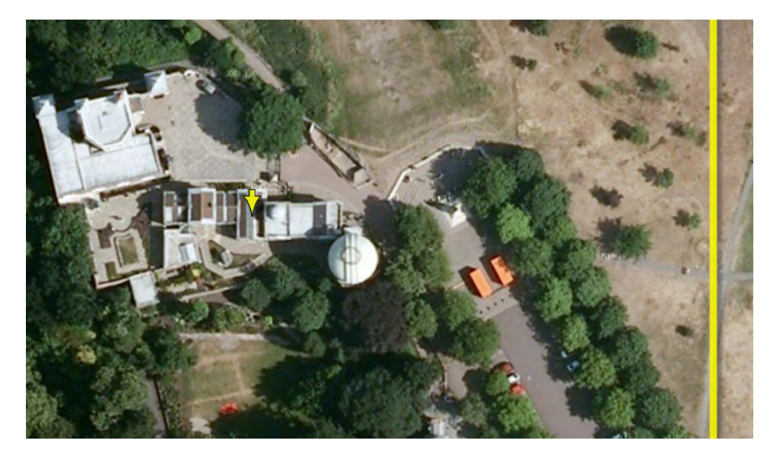
Figure 1. Greenwich Transit Circle Room v. the IERS Reference Meridian.

"Greenwich mean time is ambiguous" has also been debated within the UK Parliament's House of Lords. <sup>37</sup> However, these concerns may be assuaged as one considers the different levels of legality that may address such.